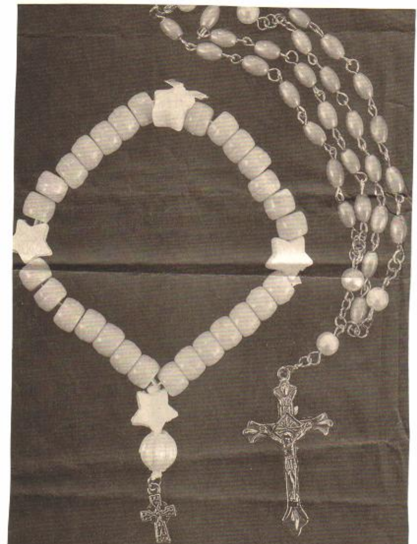
Two versions of Anglican beads, the Episcopal version of rosaries, which were created in the 1980s and serve the same purpose as the Catholic rosary.